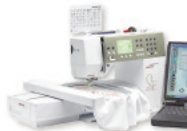
Bernina Aurora 440

Sewing machines used for the 1100 series were the Bernina aurora 440 Quilters Edition and the Bernina artista 640 with Embroidery Module . For piecing projects we used the Bernina #37 1/4" patchwork presser and the new #57 foot . Koala Cabinets provided the sewing center. We wore a Klutz Glove , a cut-resistant safety glove, while rotary cutting, used an Oliso Iron for pressing, and used Omnigrid , Omnigrip and Fons & Porter rulers for measuring. In addition to the items listed on the following pages, we also used other basic sewing supplies (such as fabric, rotary cutters, scissors, and rulers).